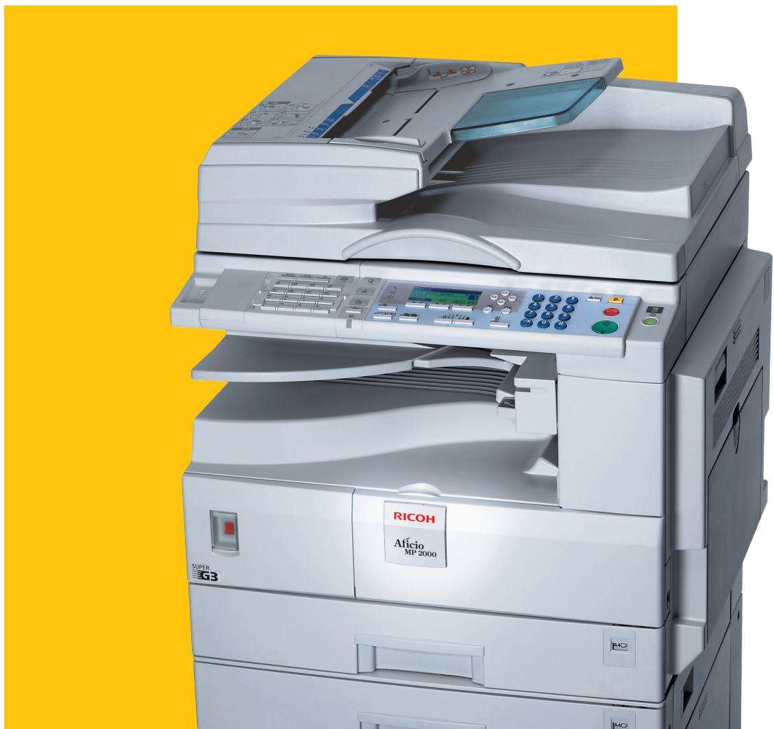
Aficio™ MP 1600/MP 2000