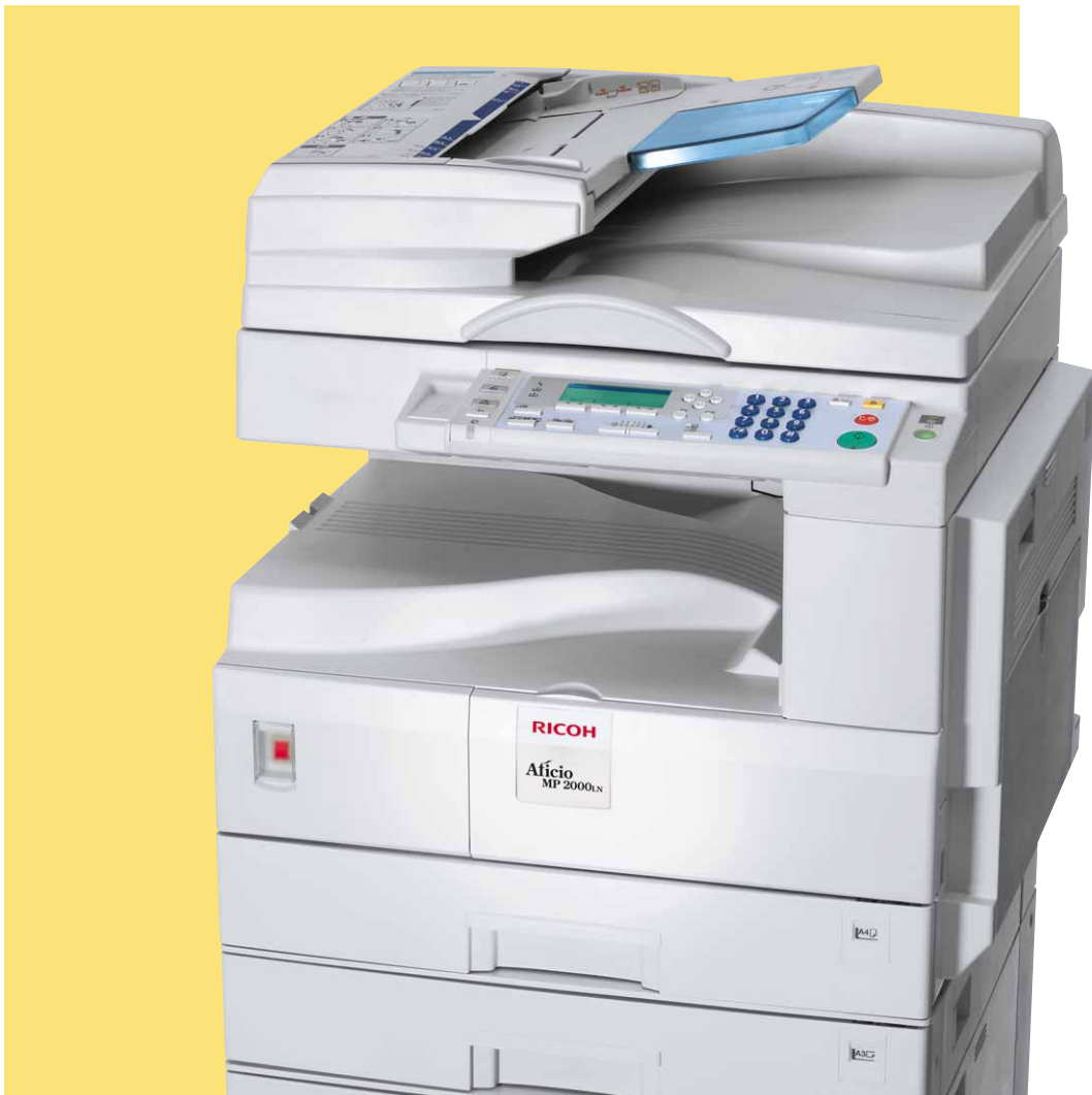
Aficio™ MP 1600L/MP 2000LN