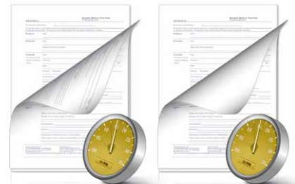
Duplex output at simplex speeds

Create double-sided prints and copies without compromising on productivity. As the MP 2000LN takes care of duplex output at simplex speeds, you need not worry about delays. Along with saving on paper costs, you safeguard the environment.