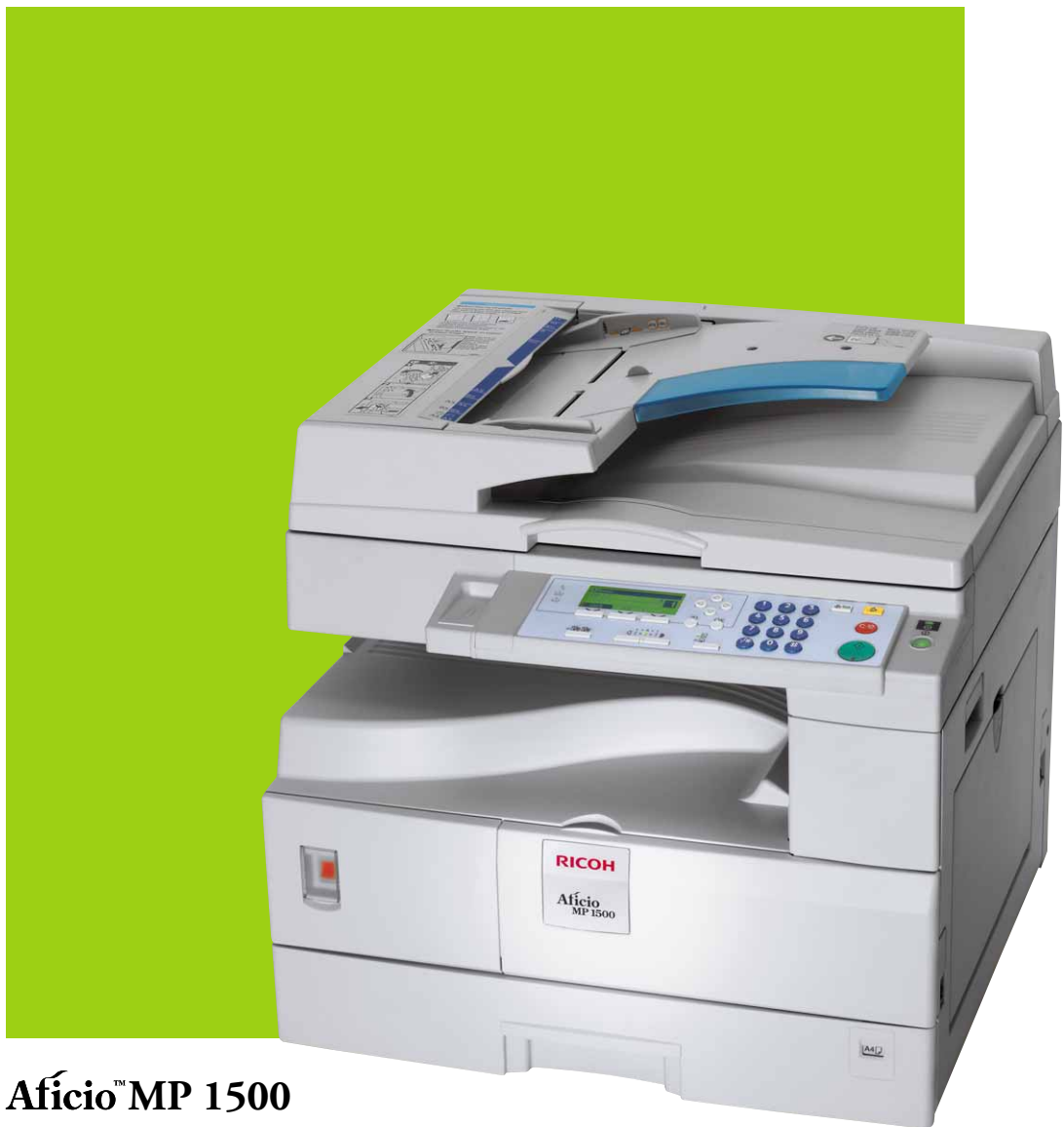
Aficio™ MP 1500