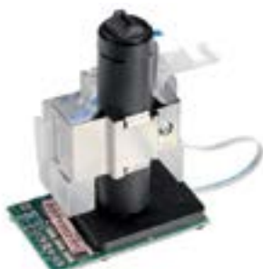
HP Optical Media Advance Sensor (OMAS)

HP Double Swath Technology provides breakthrough speed and performance. The HP Designjet Z6600 Production Printer includes two sets of three HP 771 and HP 773 Designjet Printheads, creating a wide print swath—up to 1.67 inches/42.5 mm—and a high firing frequency to deliver prints with amazing speed. Six bi-color printheads feature 1,056 nozzles per color, 1200 nozzles per inch, and small drop volumes for top photo quality.