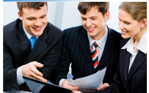
Government - Municipalities