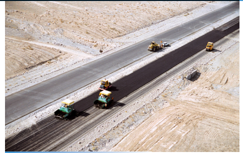
Architects - Engineers - Contractors