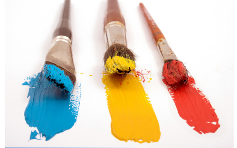
Copyshops - Reprographics