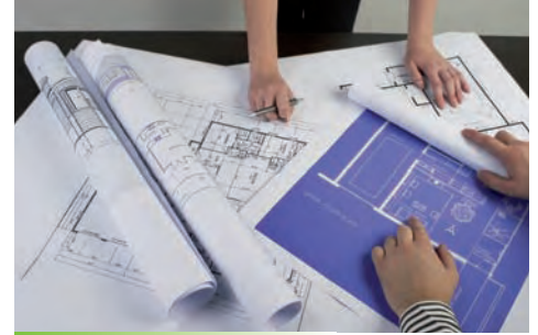
Technical Documents - Infrastructure