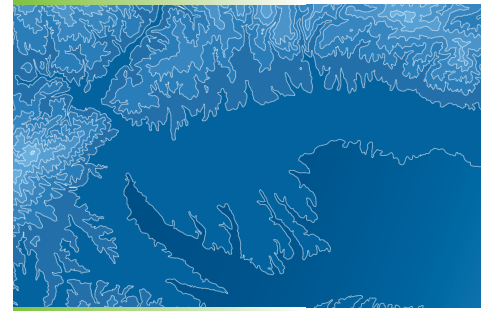
Geographic Information Systems