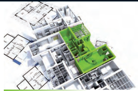
Architects - Engineers - Contractors