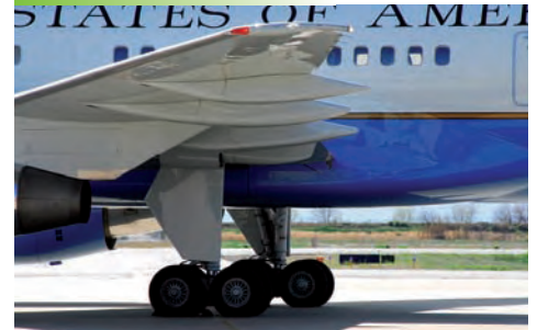
Government - Municipalities