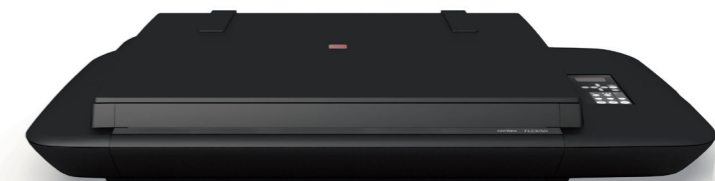
As the leading manufacturer of wide format scanners, Contex is also supported by many more imaging software packages than the competition