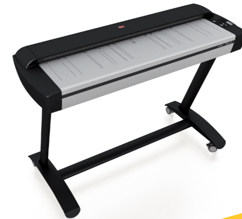
HD Series brings a new look to the industry's fastest and most flexible wide format scanners, while adding even more speed and 600dpi optical resolution.

The operator panel on every Contex scanner lets you perform common tasks directly from the scanner with convenient, programmable action buttons. The scanner