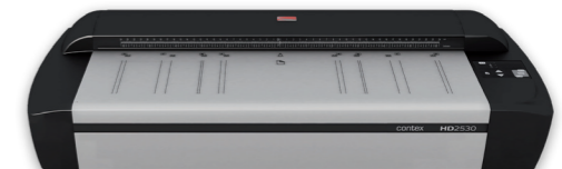
From 25 to 54-inch, sheetfed to flat-bed, Contex has the right scanner for your business needs

Image Quality > Performance > Flexibility