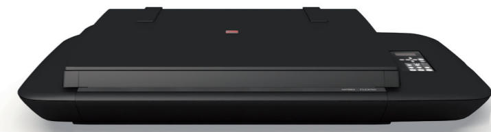
As the leading manufacturer of wide format scanners, Contex is also supported by many more imaging software packages than the competition