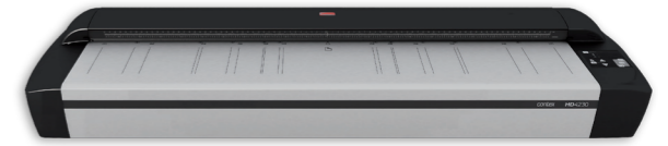
True 600dpi optical resolution provides the the highest level of detail ever in wide format.

Contex scanners are completely lead-free, meeting the RoHS European Market strict requirements for maximum levels for potentially dangerous substances in products with electronic components.