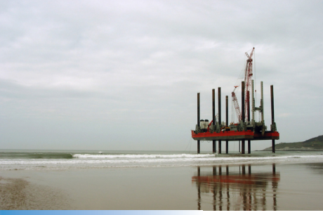
Oil & Mining Industries - Government Agencies