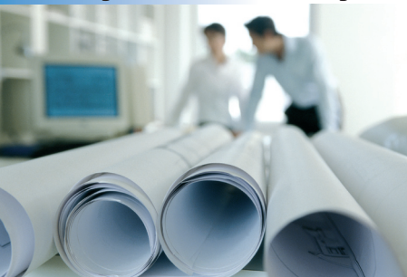
Architects - Engineers - Contractors