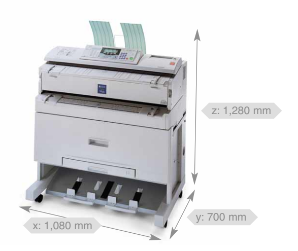
Ricoh thinks of your work environment: the Aficio™240W is the most compact wide format system on the market and can be placed close to your desk.