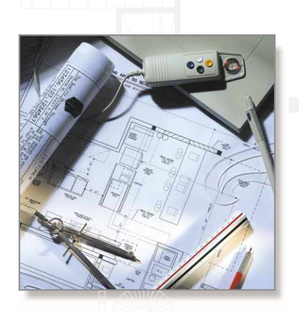
You demand accurate, high quality output. At 600 dpi and up to 256 greyscales, the Aficio™240W offers exactly that.