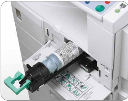
Full front accessibility for optimum ease of use and simple maintenance.

Enhance your company's image with splendid business documents. The MP 1600L/MP 2000LN deliver the precise quality you are looking for. As originals are scanned only once, stored into memory and reproduced from there, output is impeccable at all times. Crisp and clean, your documents are set to leave a first class impression.