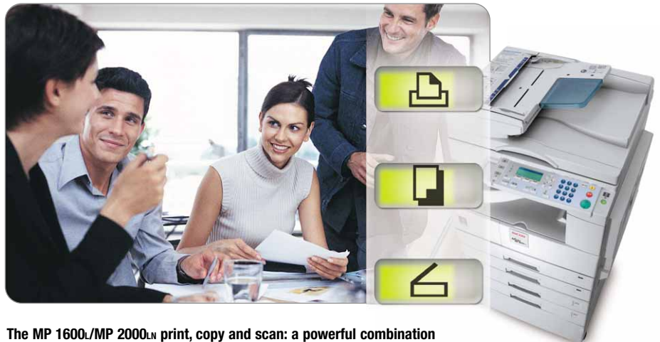
The MP 1600L/MP 2000LN print, copy and scan: a powerful combination in an ultra compact device, ready to be placed anywhere in your office.