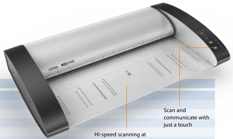
Scan and communicate with just a touch